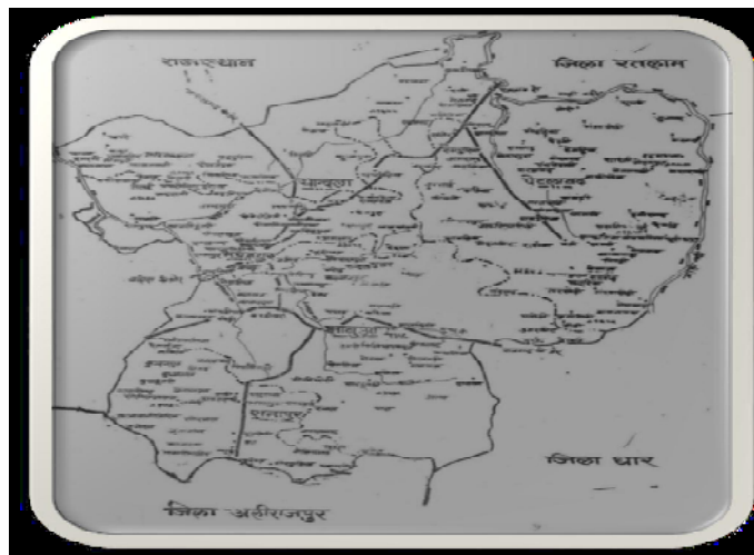
Fig.1. Jhabua had six tehsil (Talukas).

Granite contains alkaline igneous intrusions which are also responsible for fluoride enrichment in drinking water. Jhabua had six tehsil (Talukas) as shown in Fig.1.